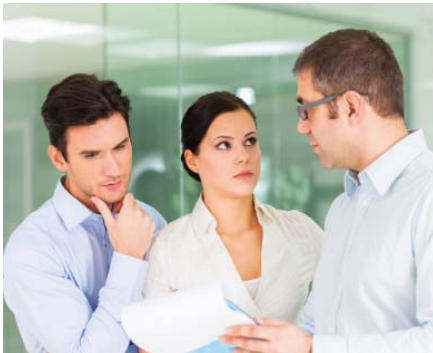
Conflict of Interest – COI.msu.edu