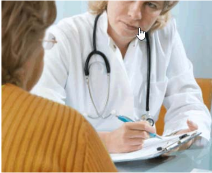
Human Research Protection Program (IRB) – HRPP.msu.edu

Questions specific to a Click form, who to add to your project, if you need to revise your application... Or about course content, what track or course to add, how to cancel... Contact the specific subject unit.