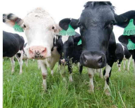
Animal Care Program (IACUC & CAR) – ANIMALCARE.msu.edu