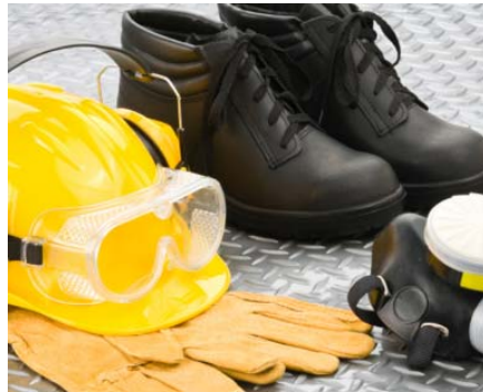
Environmental Health and Safety – EHS.msu.edu